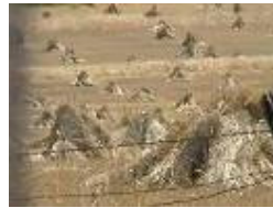
Stooks are seasonal